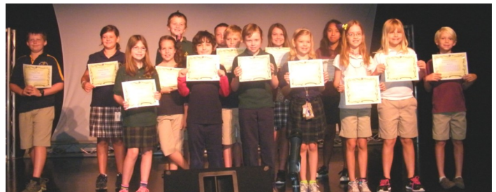
Kindergarten through second grade "Wisdom" award winners are pictured on top. Third through fifth grade winners are pictured below.