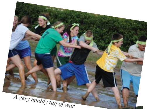
A very muddy tug of war