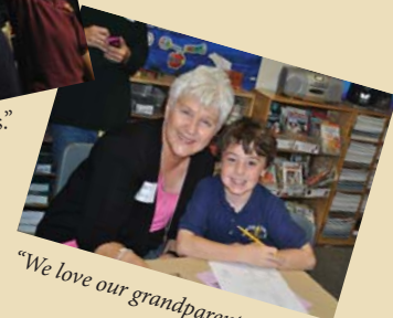
"We love our grandparents!"