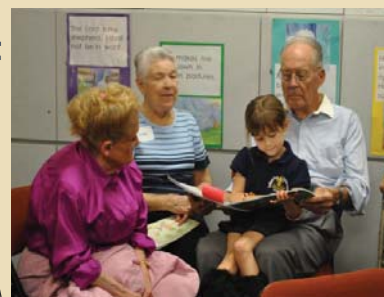
"We liked reading books to our grandparents."