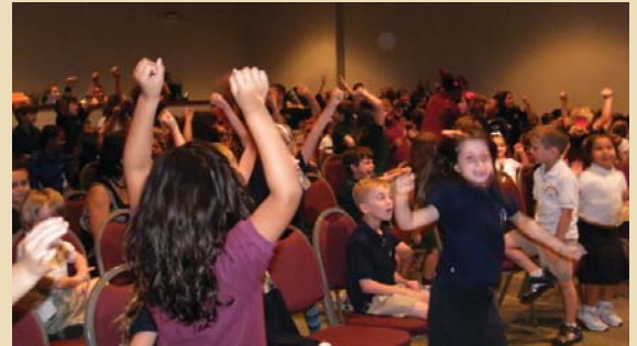
The girls react when they learn they beat the boys in the offering collection

The grand total collected in the missions offering was $5,249.30. We had a competition, and the girls beat the boys. The girls brought in $2,709.80, and the boys donated $2,539.50! This money will help send six people to the West Africa ECHO Agricultural Forum, and to outfit an entire classroom at ECHO to train missionaries about “Farming God’s Way.” They will take this information back to the mission field to share these biblical principles with the people of their villages.