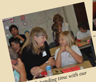
"We liked spending time with our grandparents."