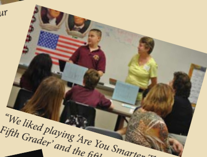
"We liked playing 'Are You Smarter Than a Fifth Grader' and the fifth graders won!"