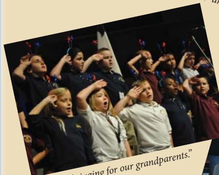
"We liked singing for our grandparents."